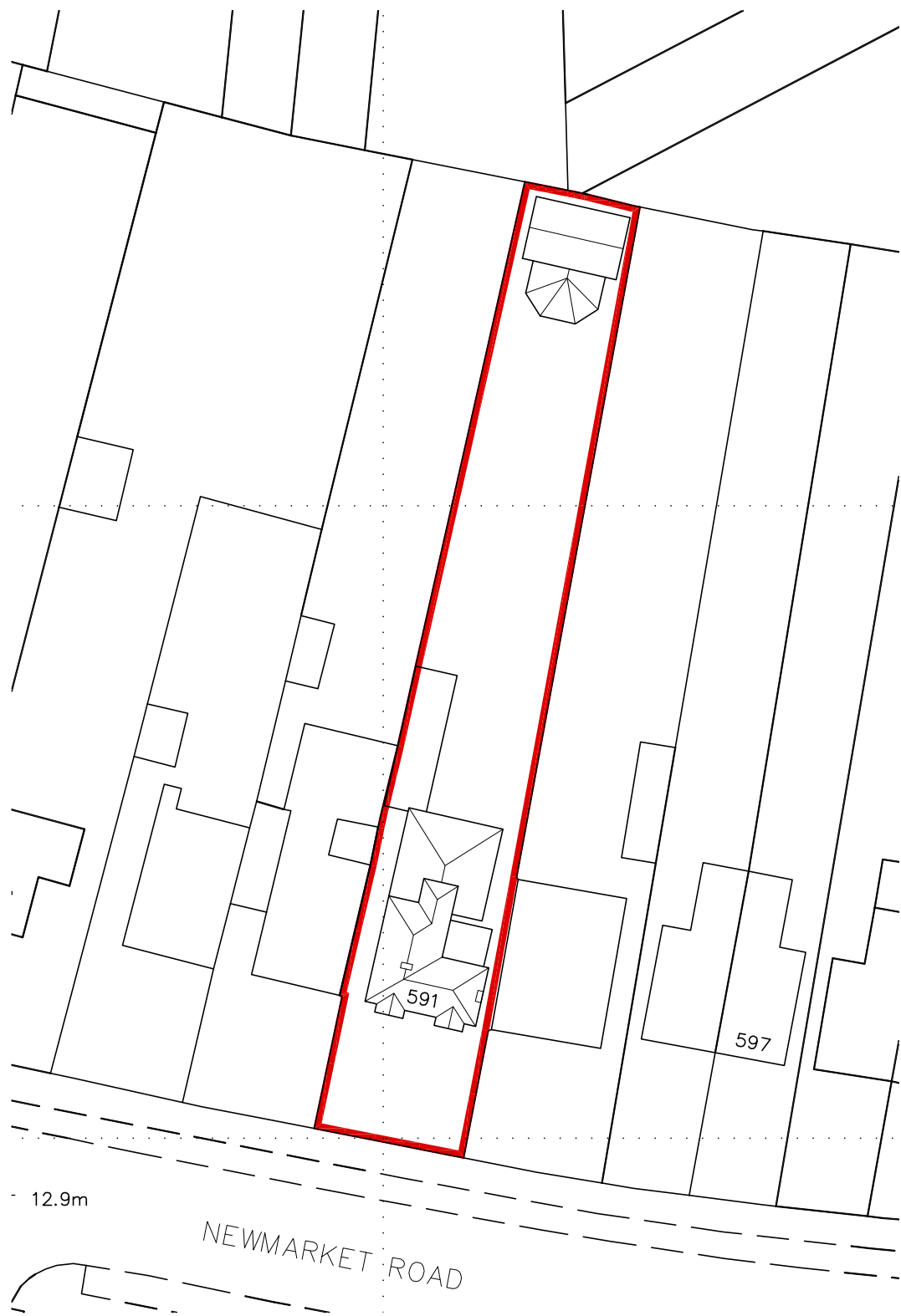
BLOCK PLAN. (1:500)